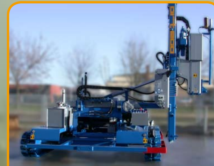
Hydraulically extendable crawler