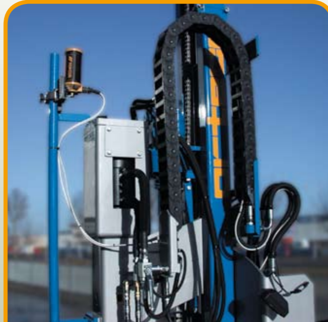
Active laser and auxiliary hydraulic circuit