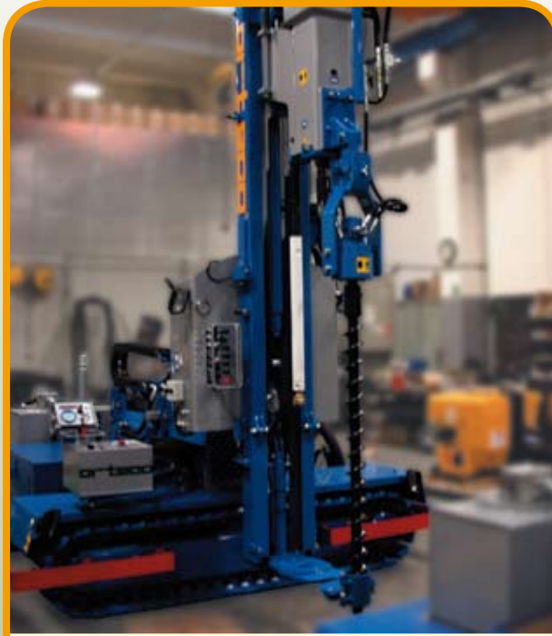
Piledriver with Hydraulic Auger