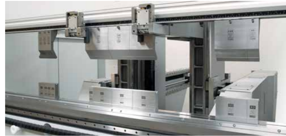
Large capacity tooling stadium maximizes tooling flexibility