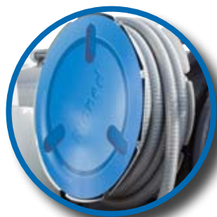
Suction hose reel with feed through connection to the tank