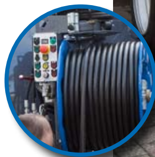
HP-hose reel with control box