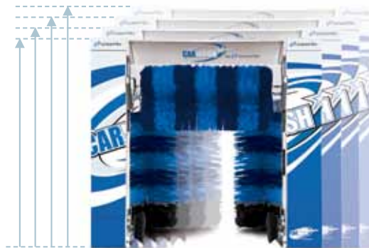
EVO R CARWASH