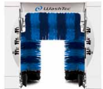
EVO R BASIC