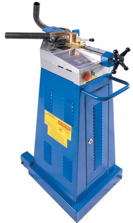
art. MB42M - MB42T