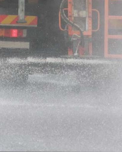
spreader with worm conveyor