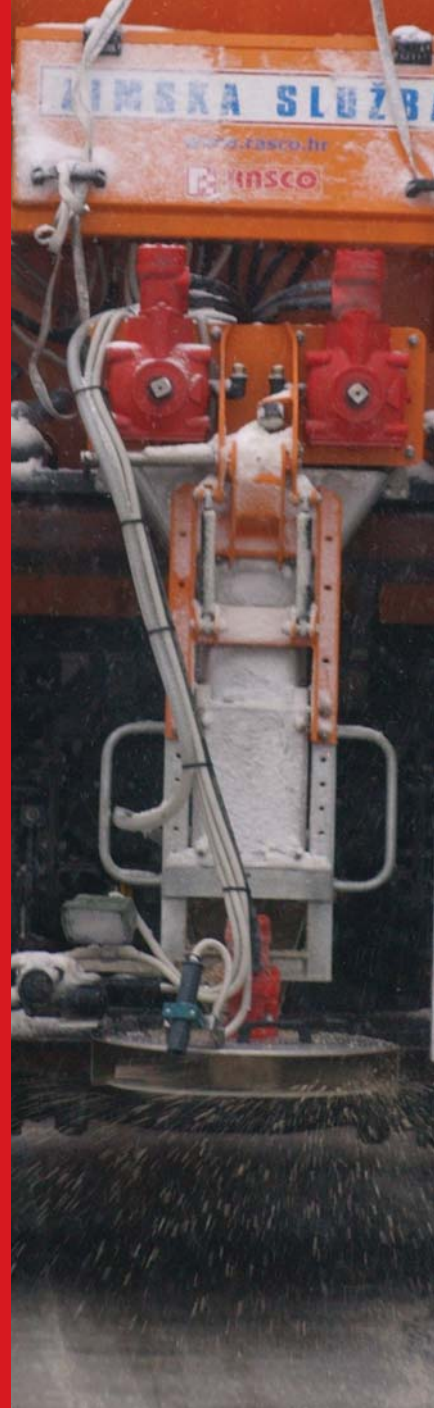
spreader with worm conveyor