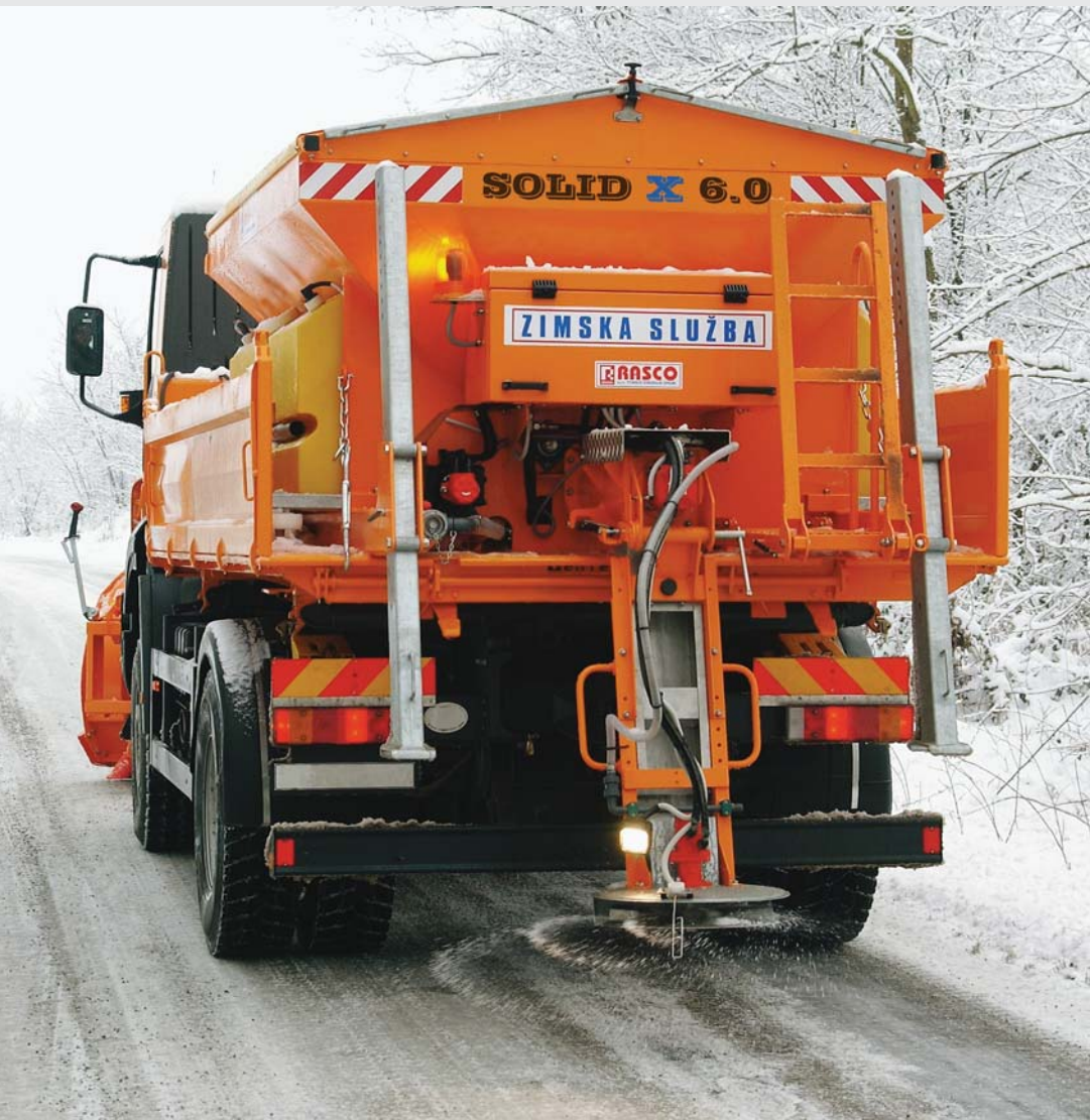
spreader SOLID X