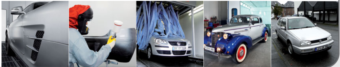
2 Added Elastic Additive 9050