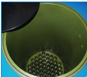
Tank capacity for 42lt PUR pails