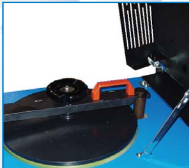
Air tight tank opening and blowing system

Up to 4 hydraulic connection per pump and 6 electrical exits, and 12 independent channels control