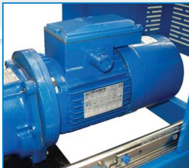
Variable speed AC pump meets production flexibility