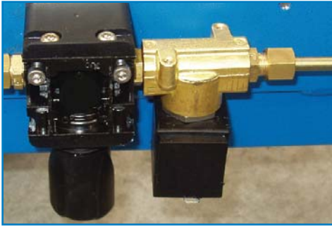
Gas blanket system maintains complete adhesive properties