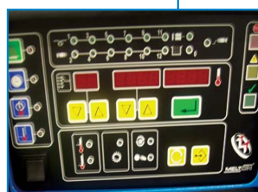
Friendly panel control