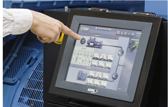
APM802 dedicated to power plant management

The new APM802 command/control system is specifically designed for operating and monitoring power plants for markets including hospitals, data centres, banks, the oil and gas sector, industries, IPP, rental and mining. This unit is available as standard on all generating sets from 275 Kva designed for coupling. It is optional on the rest of our range.