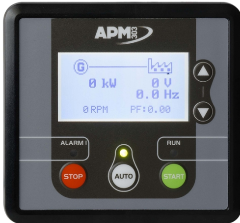
APM303, comprehensive and simple

The APM303 is a versatile unit which can be operated in manual or automatic mode. It offers the following features: Measurements: phase-to-neutral and phase-to-phase voltages, fuel level (In option : active power currents, effective power, power factors, Kw/h energy meter, oil pressure and coolant temperature levels) Supervision: Modbus RTU communication on RS485 Reports: (In option : 2 configurable reports) Safety features: Overspeed, oil pressure, coolant temperatures, minimum and maximum voltage, minimum and maximum frequency (Maximum active power P<66kVA) Traceability: Stack of 12 stored events For further information, please refer to the data sheet for the APM303.