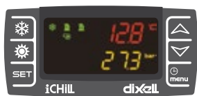
IC208CX microprocessor controller.