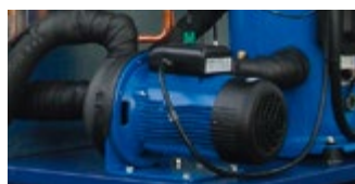
Pump P3 (3 barg) / P5 pump (5 barg, optional).