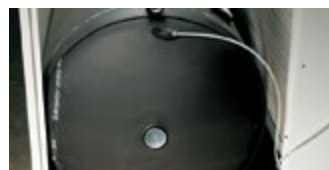
Integrated high capacity water tank.