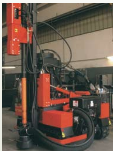
DOWN THE HOLE HAMMER